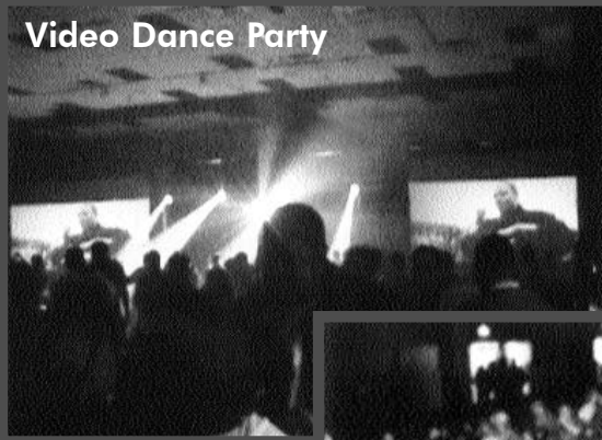
Video Dance Party